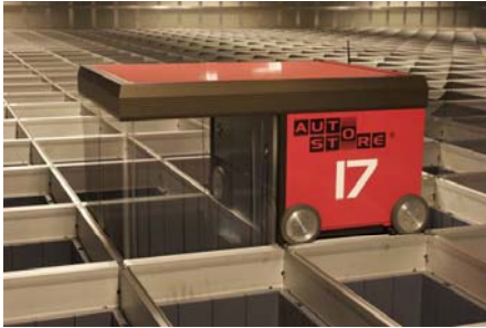
Robot in action