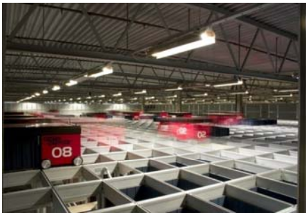
Robots in action