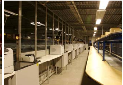
Pick and pack area